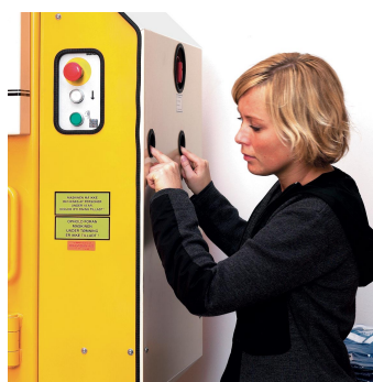
The bale is ejected by a safe two-hand operation.