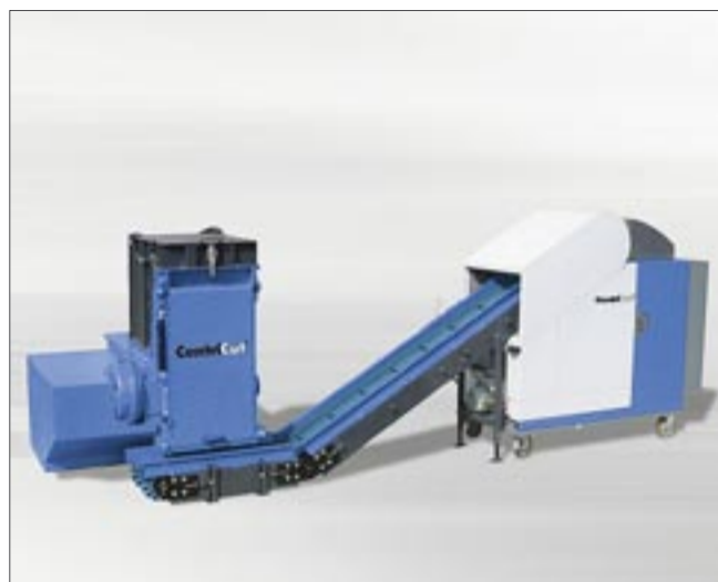
CentriCut 44n being used as a fine granulator in combination with a single-shaft preliminary shredder

*Throughput varies depending on screen size and the type, size and density of the processed material / Technical changes reserved