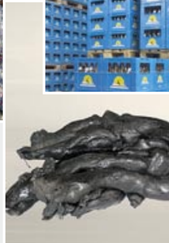
e.g. caked material