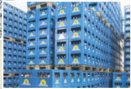
e.g. drinks packs