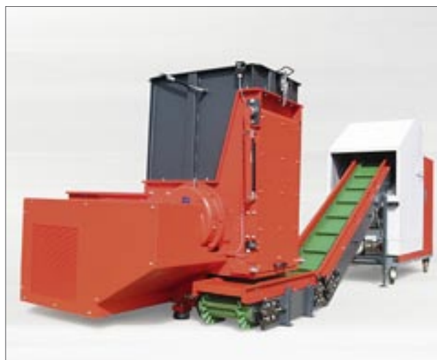
Two-stage granulating plant

CentriCut ® the smart cutting revolution