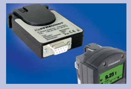
Also by memo box the data exchange can be carried out.

Exchange weighing and master data between the scale and PC per GSM modem or radio.