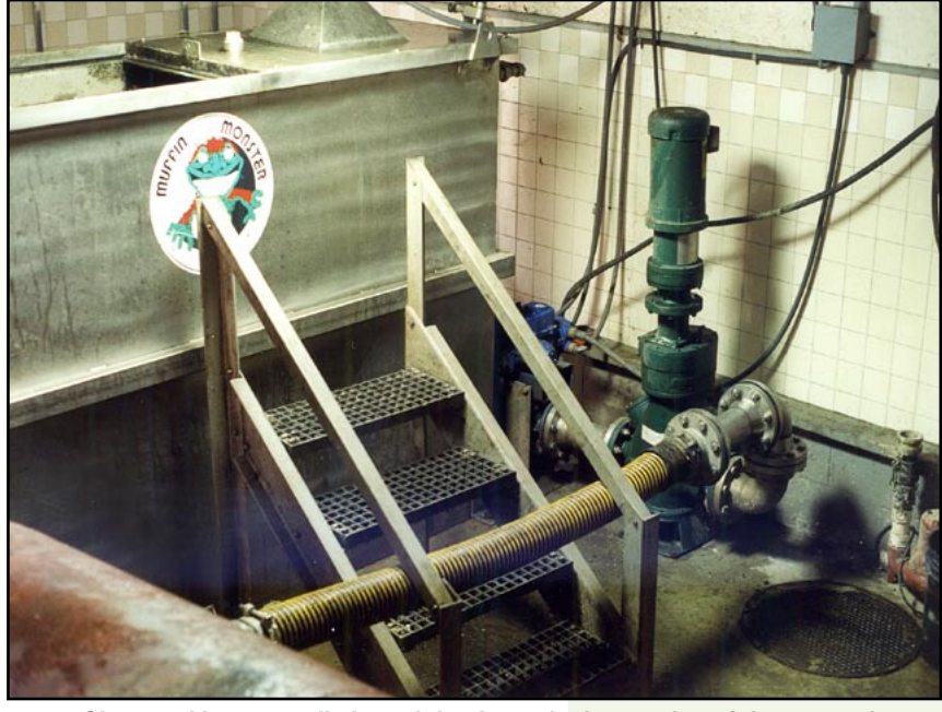
Clogs and jams are eliminated thanks to the integration of the powerul and very hungry Muffin Monster grinder.