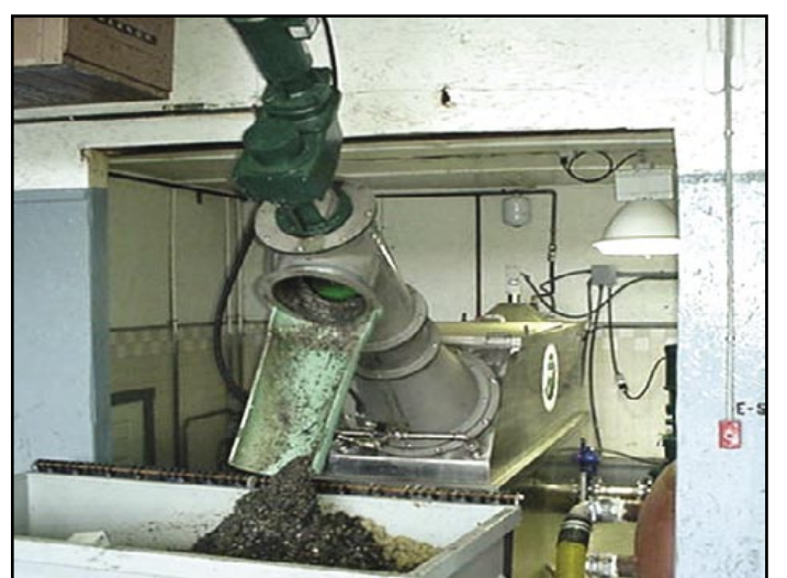
The Honey Monster grinds, washes and screens solids, reducing odor and decreasing volume.

The Honey Monster is an easy-toinstall modular system that removes inorganic solids from wastewater,