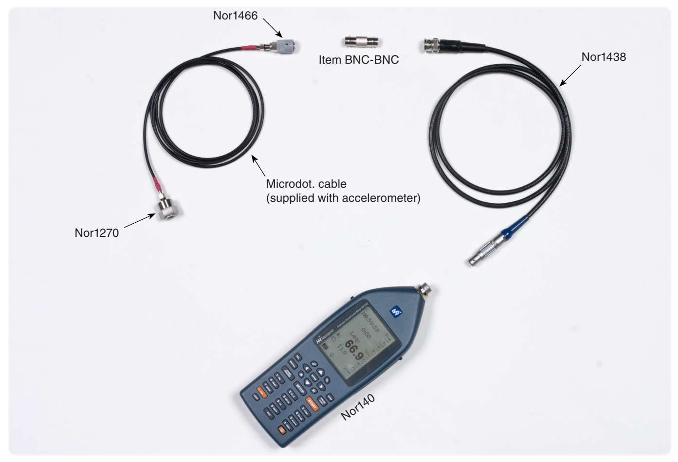
Set-up for using an ICP<sup>®</sup> or CCP type of accelerometer connected to Nor140. Power to the accelerometer is supplied from the instrument by selecting ICP in the instrument menu as preamplifier.

Alternatively, a charge sensitive accelerometer may be used and coupled to the normal microphone preamplifier Nor1209 through the adapter with BNC input Nor1447/2 and the BNC to microdot adaptor Nor1466. The voltage sensitivity will depend on the total capacitance of the cables and adaptors and the calibration procedure is thereby more complicated than for the ICP-type of accelerometers if a vibration calibrator is not at hand. Due to the high impedance of the signal from the transducer, the cables will also often be sensitive to vibration. However, charge sensitive accelerometers often have lower weight and may tolerate higher temperatures.